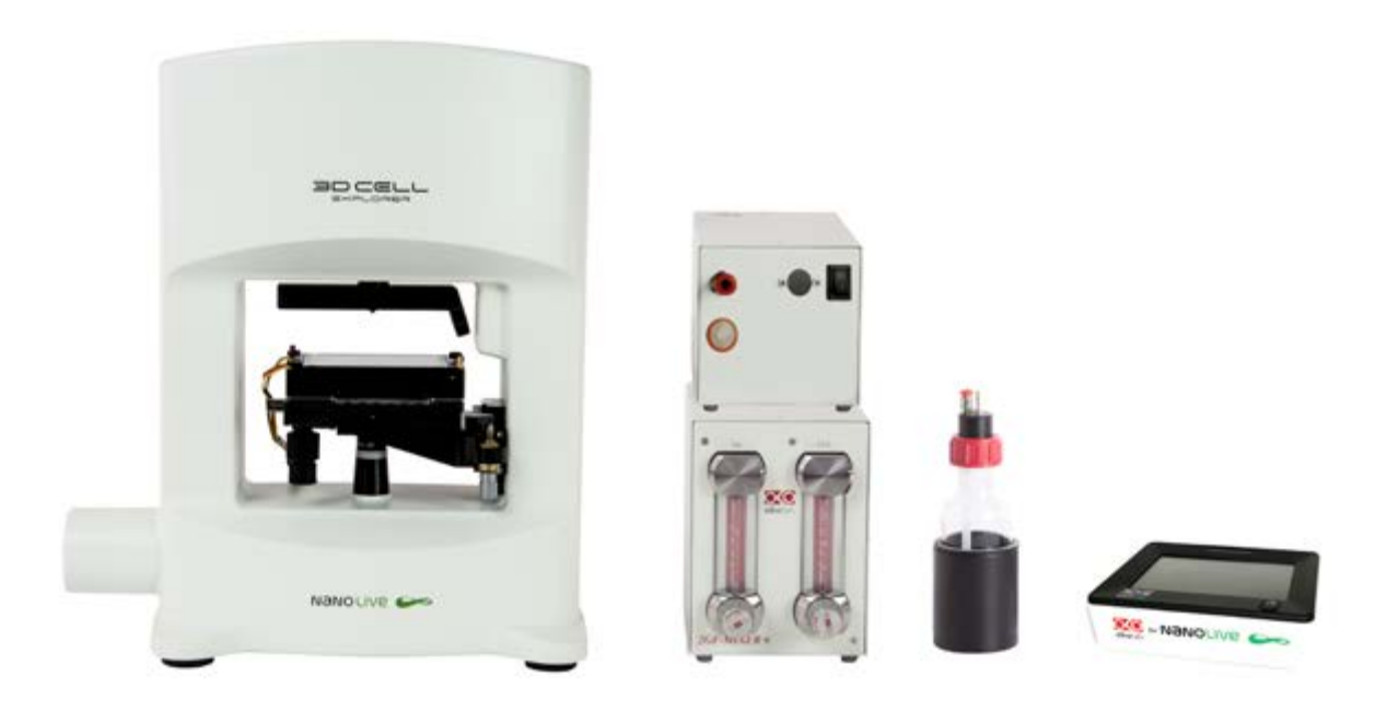
Figure 2: 3D Cell Explorer set up with its top stage incubator

Secondly, you will need the Nanolive's top stage incubator equipment. This includes the top stage incubation chamber, a controller pad, and a humidity system. We recommend using our CO_2 mixer and air pump that will ensure a proper control of CO_2 proportions and will help you save some money on compressed air. Learn how to set up your Nanolive Top Stage Incubator here: <u>http://nanolive.ch/supporting-material/#setup-incubator</u>.