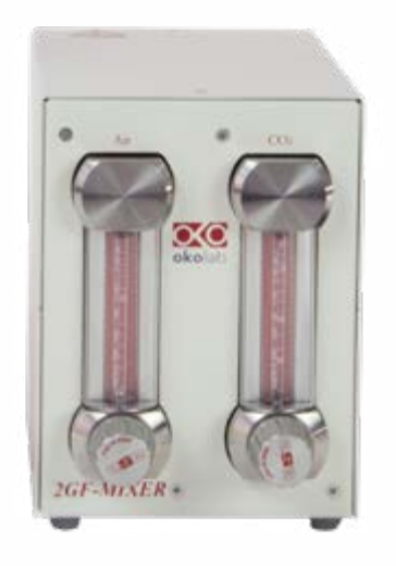
Figure 4: Manual Air / CO<sub>2</sub> Mixer

We recommend setting the \rm CO_2 to 8-10% if you are using DMEM or other medium with carbonate buffers.