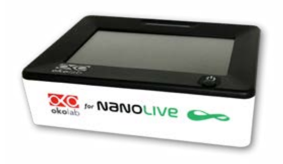
Figure 3: Top Stage Incubator Temperature Controller

Start the microscope and the computer, place the chamber on the microscope stage (if you just got it, remove the blue stickers within the removable part of the chamber that might impact the flatness of your field of view), connect it properly (see manual and set up video: <u>http://nanolive.</u> <u>ch/supporting-material/#setup-incubator</u>) and place the lid. Switch the controller on, and set the temperature to 38 degrees C°.